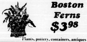
Boston Ferns $3.98