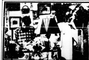
The Living Roots 4574 Park Blvd. 298-3468 5 blocks north of El Cajon Blvd.